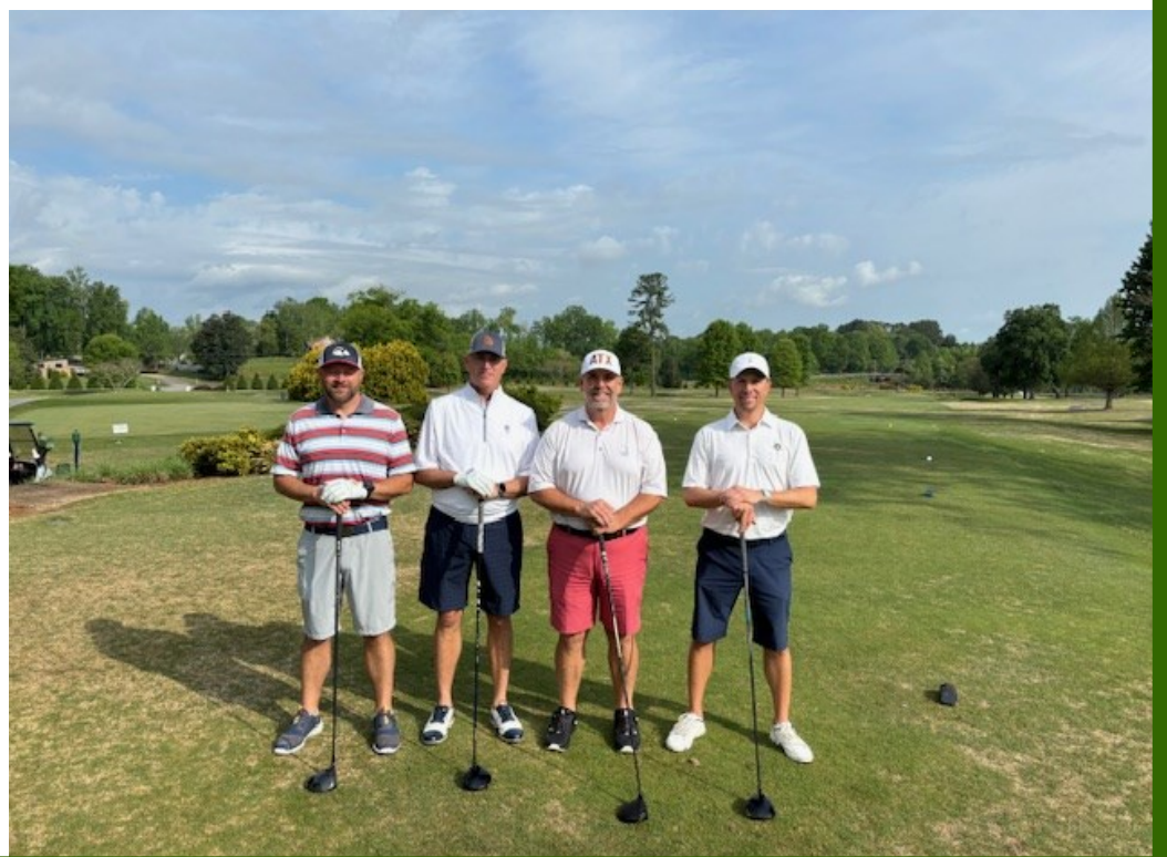
MASTERS SHOOTOUT WINNERS